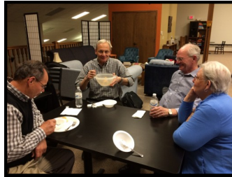
Enjoying lunch in Buhler

In Feb., we had opportunity to assist Caring For The Heart at a seminar in Buhler, KS. We enjoyed interacting with the other counselors and watching God work in the lives of people.